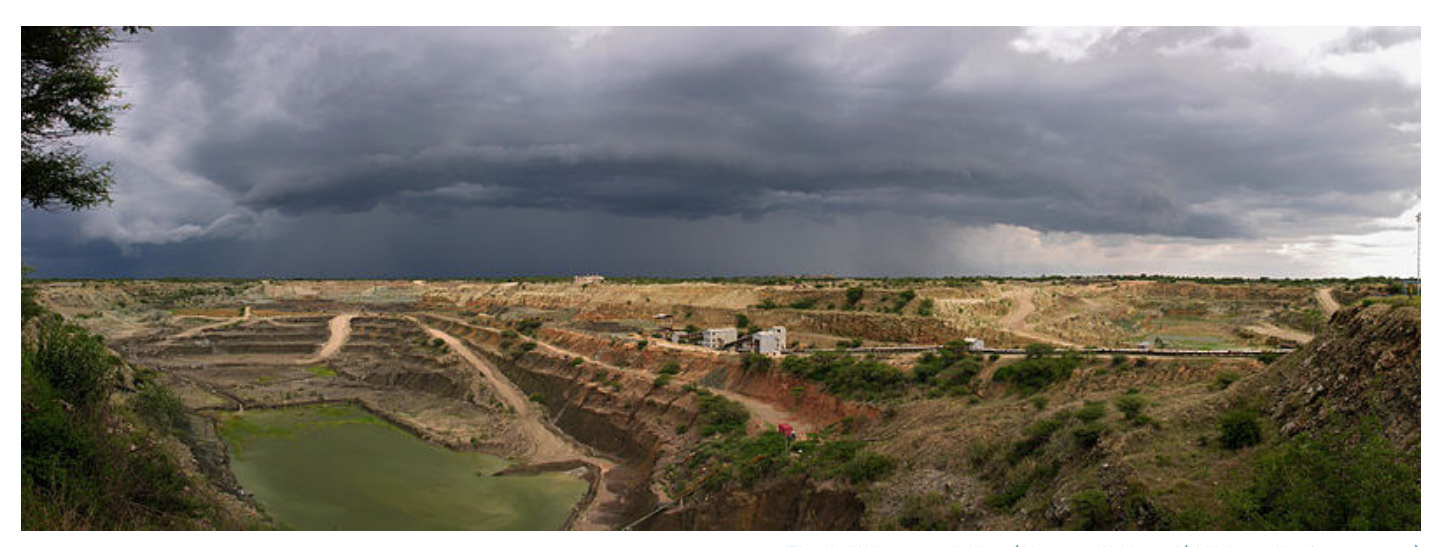
The Williamson Mine

In its 29 August letter, RAID informed Petra Diamonds of reports of abuses at an onsite detention facility operated by Zenith. 49 RAID requested responses to questions regarding the legal basis for such a facility, copies of policies for detaining individuals and details about its operation. Petra Diamonds did not respond to these questions. In its reply, Petra Diamonds referred to the closure of an "on-site facility" that "had been used by the Tanzanian Police as a temporary police post where trespassers on the mine would be detained by the police before their transfer".50 It was not made clear whether this "post" is supposed to be the same facility identified in RAID's letter and described in this section, and RAID's request to Petra Diamonds that it clarify whether the facility was the same received no response.<sup>51</sup> Those interviewed by RAID who described being detained on the mine site consistently told RAID that it was Zenith guards who took them to and operated the facility, including determining when, if at all, they were permitted to eat, drink or leave.