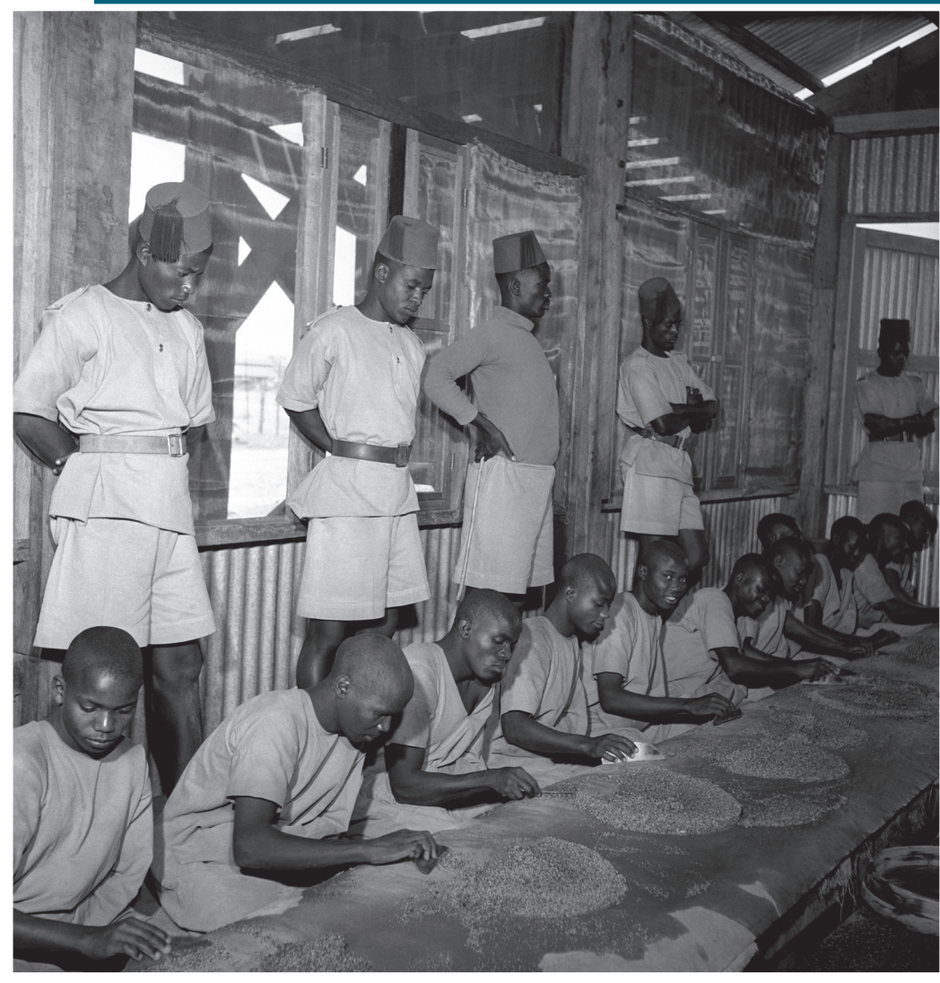
Young men working with one sleeve sewn up for security at the Williamson Mine's sorting office (1948)