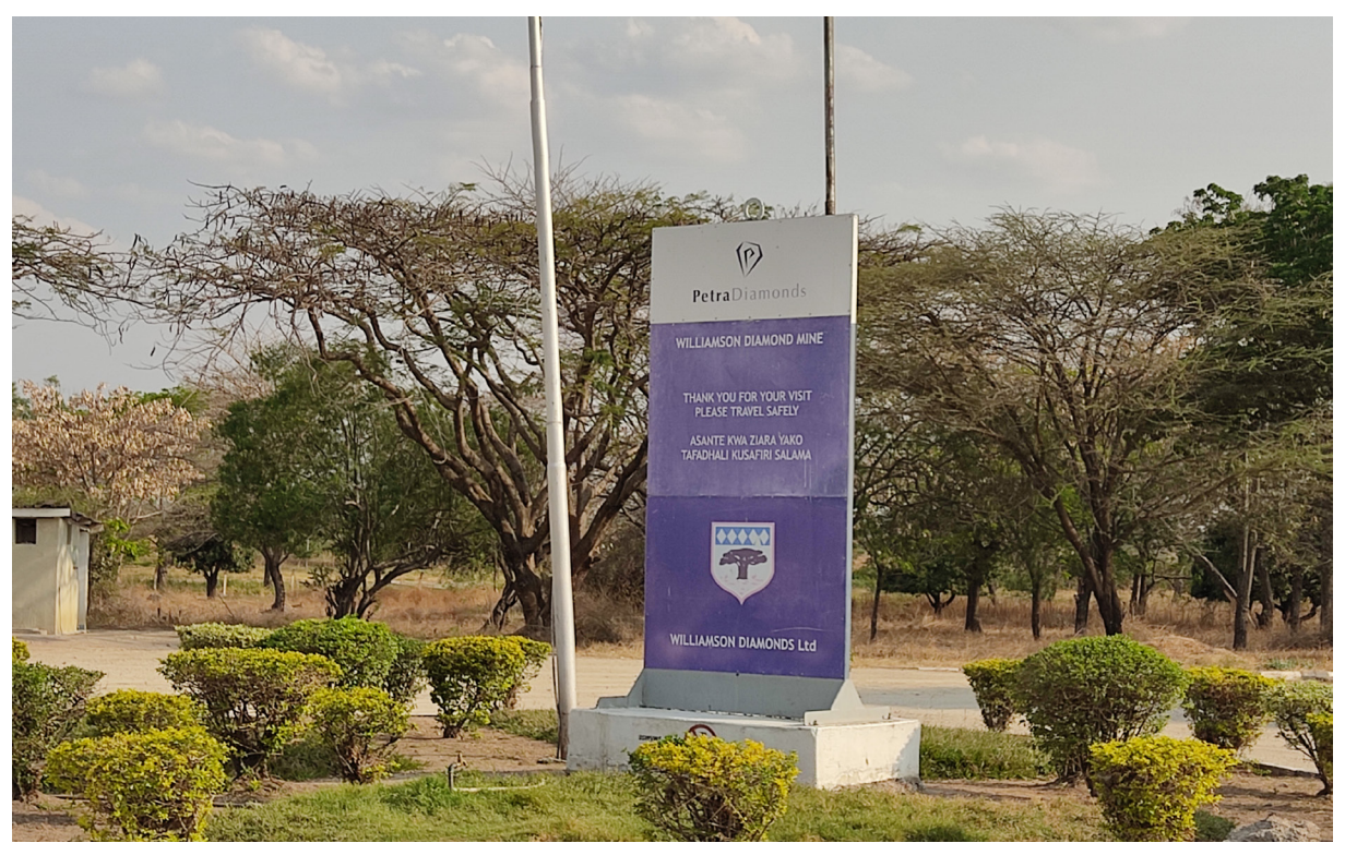
At the main entrance of the Williamson Diamond Mine

In April 2020, Petra Diamonds placed the Williamson Mine on care and maintenance, citing the impact of Covid-19. It announced that it would look to resume operations when diamond prices made it operationally sustainable.18