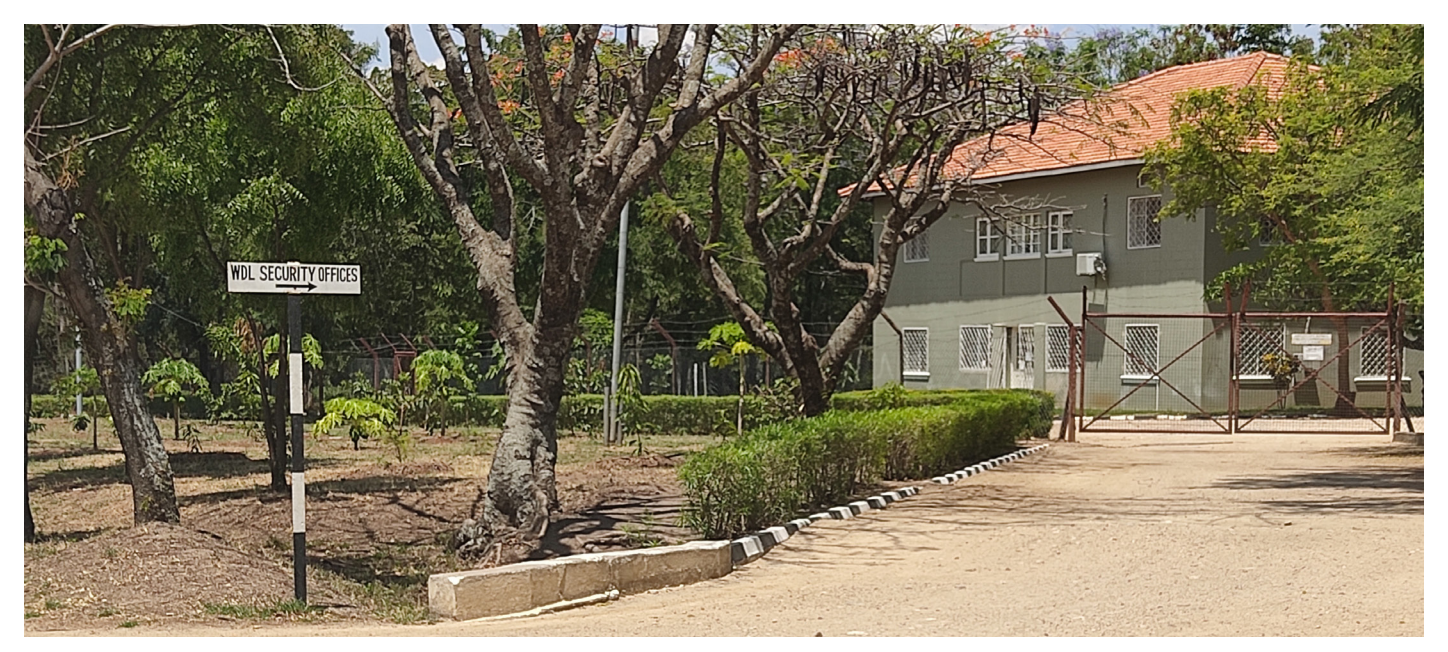
Security offices at the Williamson Diamond Mine, Mwadui

WDL ensures compliance with this policy. RAID also asked for information about the security providers the company uses, including which security companies it contracted with and how they were armed. Petra Diamonds did not respond to any of these requests. Some very basic information was provided to RAID in an on-the-record meeting between RAID and senior management of Petra Diamonds in September 2020.