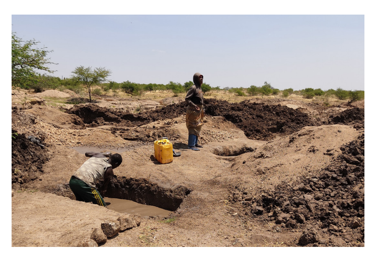
Artisanal miners digging for diamonds, Kishapu District, Tanzania.

Artisanal mining has been practiced for generations. Maganzo, the largest local town near the mine, began as a camp during the colonial era, functioning as a labour market for Dr Williamson's mine and a service centre for its African