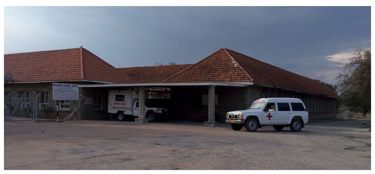
Williamson Diamonds Hospital, the mine-owned and operated hospital within Mwadui

Leigh Day has filed a legal claim in UK courts on behalf of over 30 Tanzanian nationals against Petra Diamonds and WDL for alleged human rights abuses.