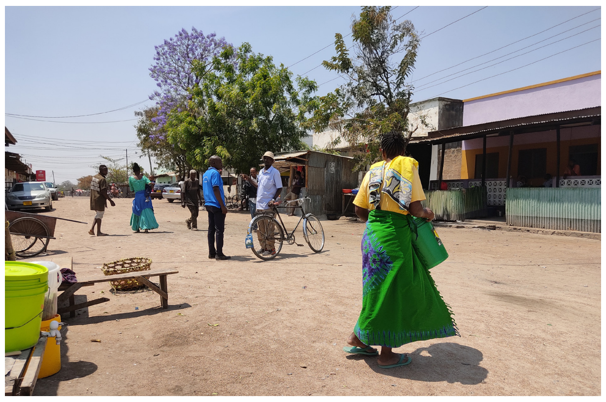
Main street in Maganzo town, Kishapu District, Tanzania.

At the time of publication, many of the people interviewed for this report are in need of medical treatment that they cannot afford. The injuries and deaths documented have also meant that individuals and families face even more precarious economic circumstances than they would otherwise. How best to remedy some of the harms detailed pose complicated questions, and some, such as the loss of family members, can obviously never be fully remediated. But certain forms of remedy are clearly necessary and urgently so. Providing for healthcare and ensuring economic security are evidently essential first steps in any meaningful remedial process. Full and effective remedies should follow as swiftly as possible.